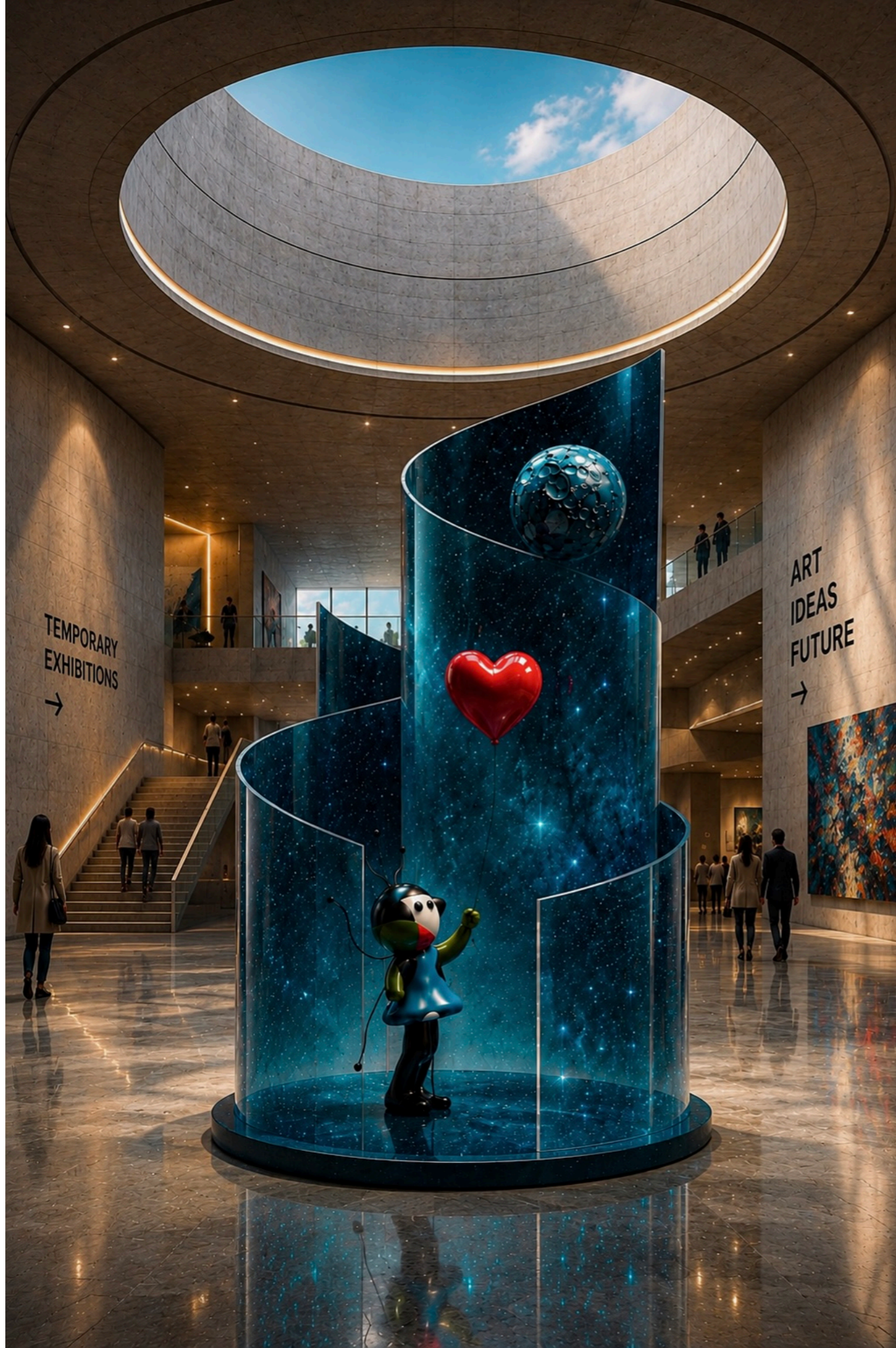
What if the universe could feel? Monumental Edition 305 cm/ 10 ft.